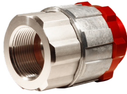
Female COM A Sculflow Swivel

Setting Standards in Safety and Dependability since 1936.