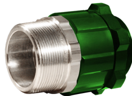
Male COM B Super Nozzle Swivel