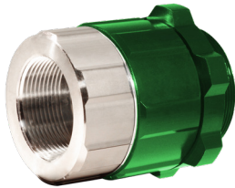
Female COM B Super Nozzle Swivel